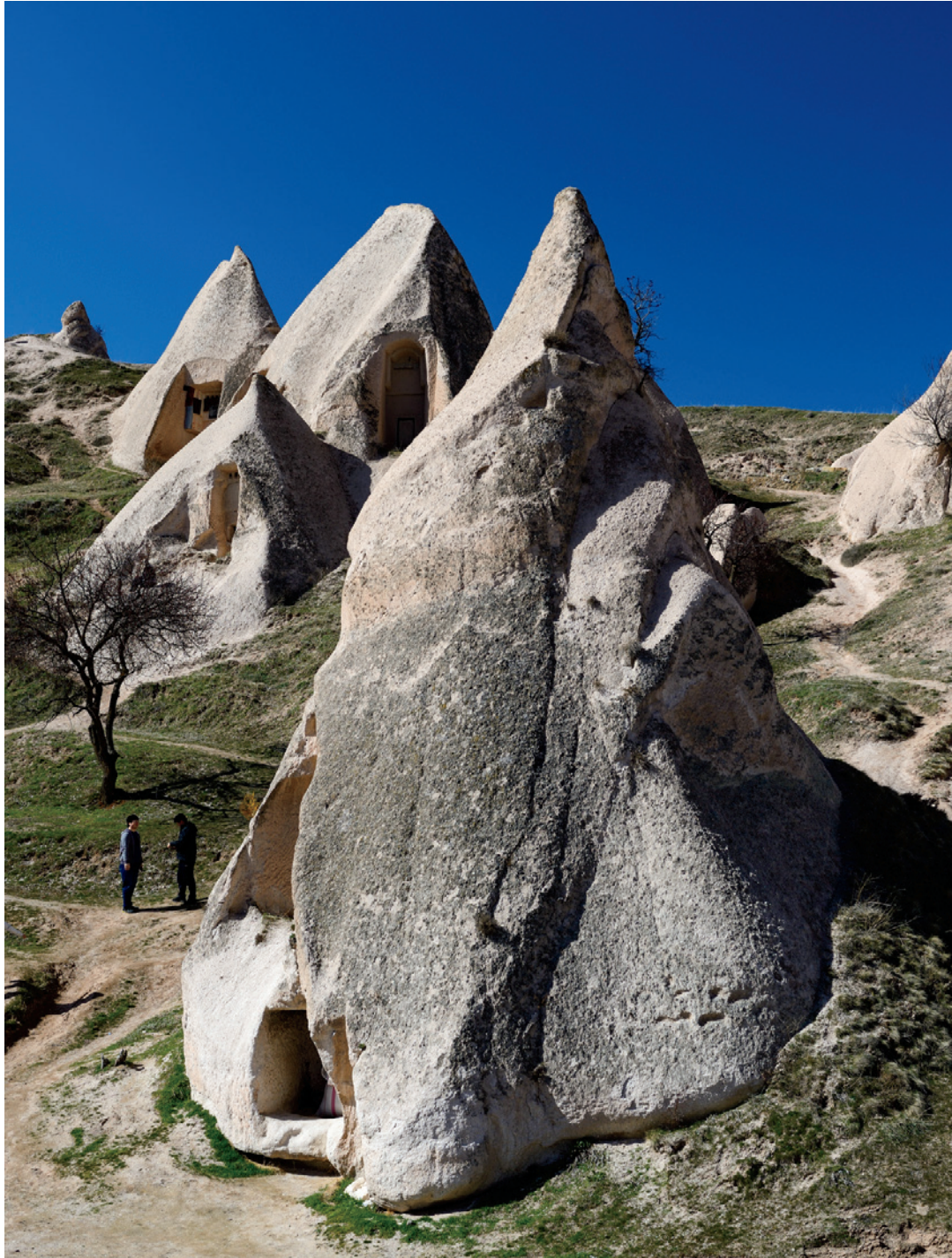
Uçhisar, Nevşehir, Turkey

Copyright © 2018 Massachusetts Medical Society.